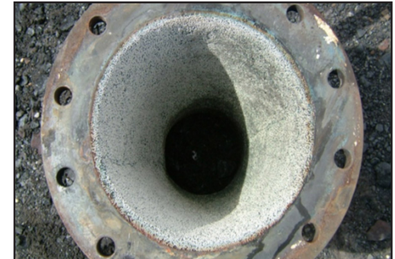
Spool after 6 months with over 85% of original thickness remaining