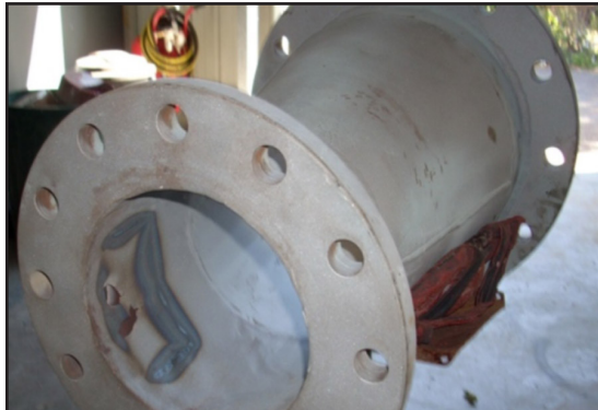
Spool piece after 4-6 months with tile removed and weld patch over hole

Abrasion and impact of 2" (50 mm) rock and clay particles at spool neck cracks tiles, leading to disbondment and clogging.